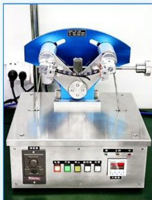
Leather strap abrasion tester