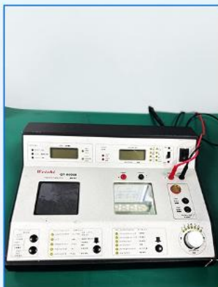
Quartz watch timing tester