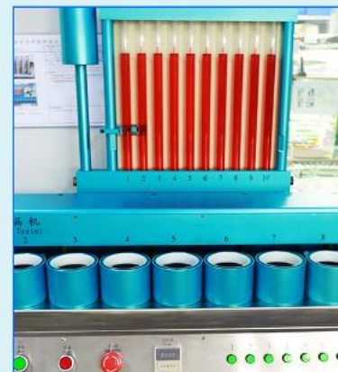
30ATM Waterproof tester