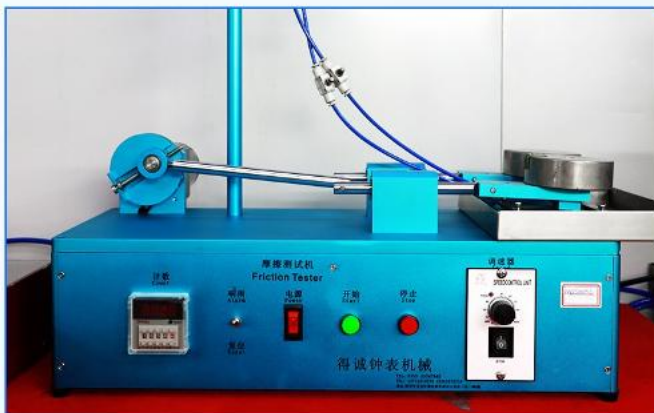
Leather strap abrasion tester

Comprehensive Testing for Quality Assurance