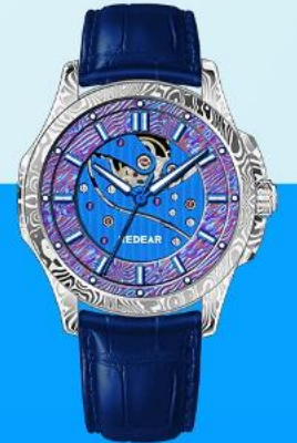
Damascus Steel Watch

Moderate hardness & durability; High stability; Rust & corrosion resistant