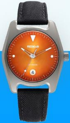
Titanium Alloy Watch

Every material is carefully selected to ensure exceptional precision, durability and unique aesthetic value.