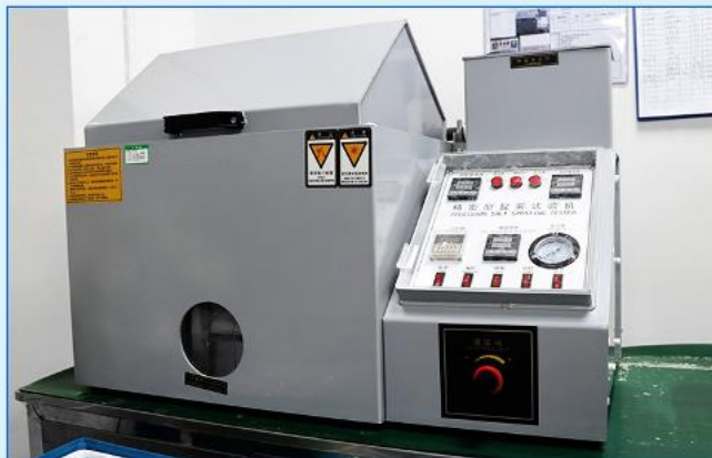
Salt spray corrosion tester