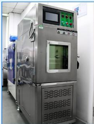
Constant temperature & humidity tester