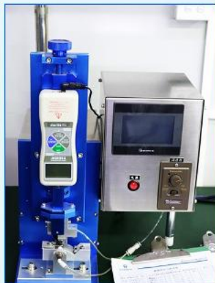
Buckle lifetime tester