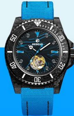
Carbon Fiber Watch

Transmittance \geq 92\% ; Mohs hardness 6-7; Clear & scratch-resistant