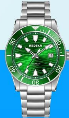
Stainless Steel Watch

1/5 the weight of steel; 5x the strength of steel; Unique texture