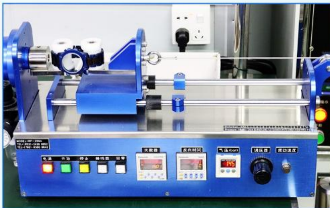
Leather strap tension tester