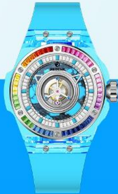
K9 Crystal Glass

Natural oxidation; Unique patina over time; Vintage, solid feel